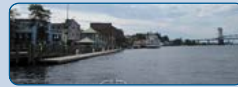
Cape Fear River

UNCW Results Summary: 2019 sampling occurred during spring and early summer, but did not include the hotter summer months. Excessive fecal coliform bacterial counts occurred in several Wilmington watersheds, particularly in Burnt Mill Creek, upper Bradley Creek, upper Hewletts Creek and the Greenfield Lake tributaries. A number of algal blooms occurred, in Greenfield Lake, Burnt Mill Creek, and upper Howe Creek. Dissolved oxygen problems primarily occurred in the tributaries of Greenfield Lake. In summer 2019, several dogs died of toxic algae poisoning after swimming in a private stormwater retention pond in Wilmington. UNCW researchers suggest that humans and pets stay out of retention ponds as they may contain algal blooms, fecal bacteria, and chemicals.